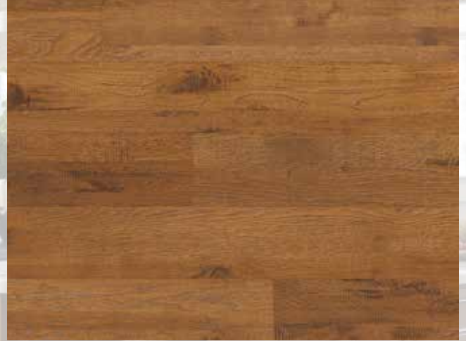
277 St. John's Hickory