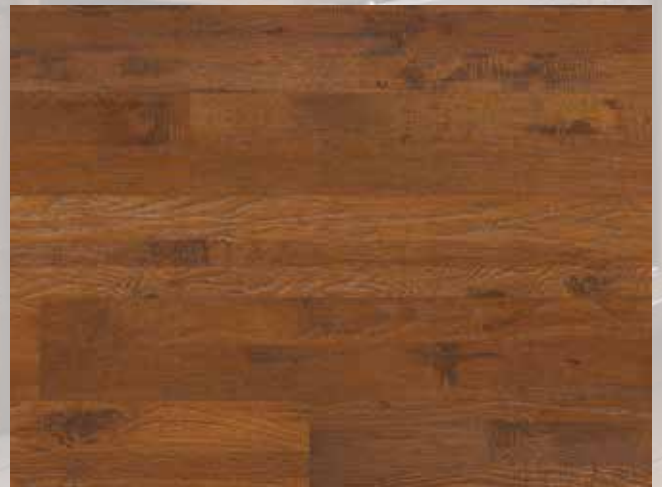
617 Tellico Hickory