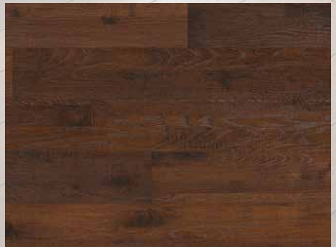
878 Flint River Hickory