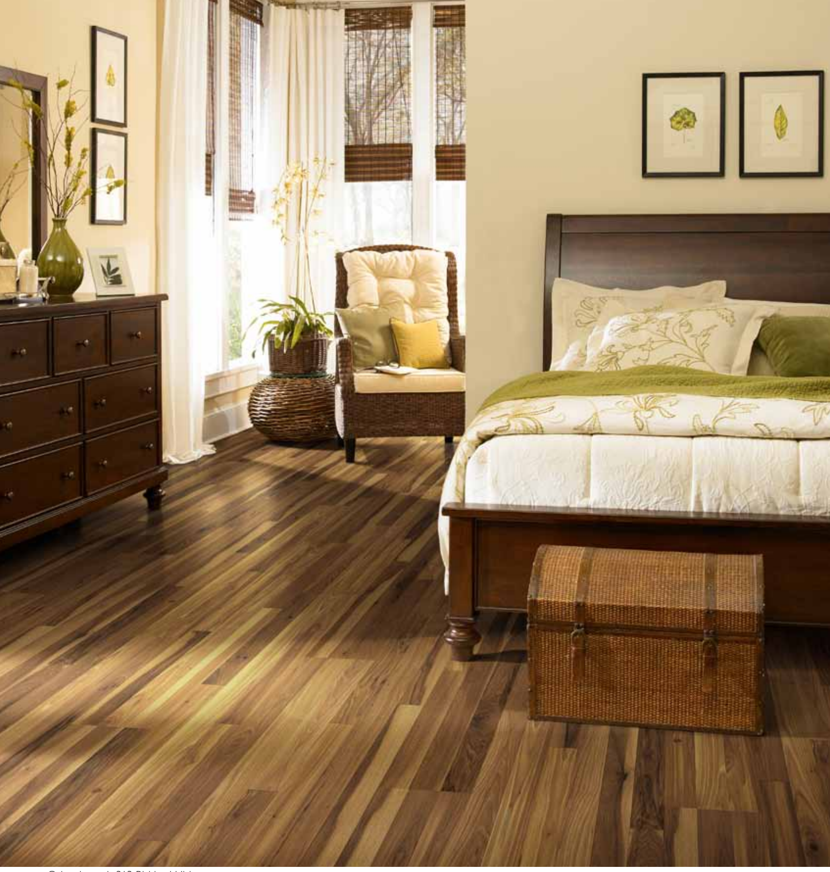
Color shown is 313 Richland Hickory