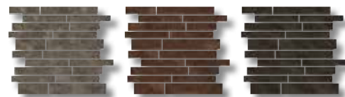
300 Spanish Moss 700 Brownstone 900 Graphite