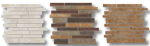
100 Sand 101 Multi 200 Wheat