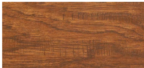
600 Ancient rusty, red-toned brown