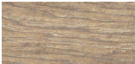
500 Relic weathered driftwood gray