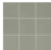
500 Light Grey