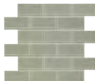
500 Light Grey