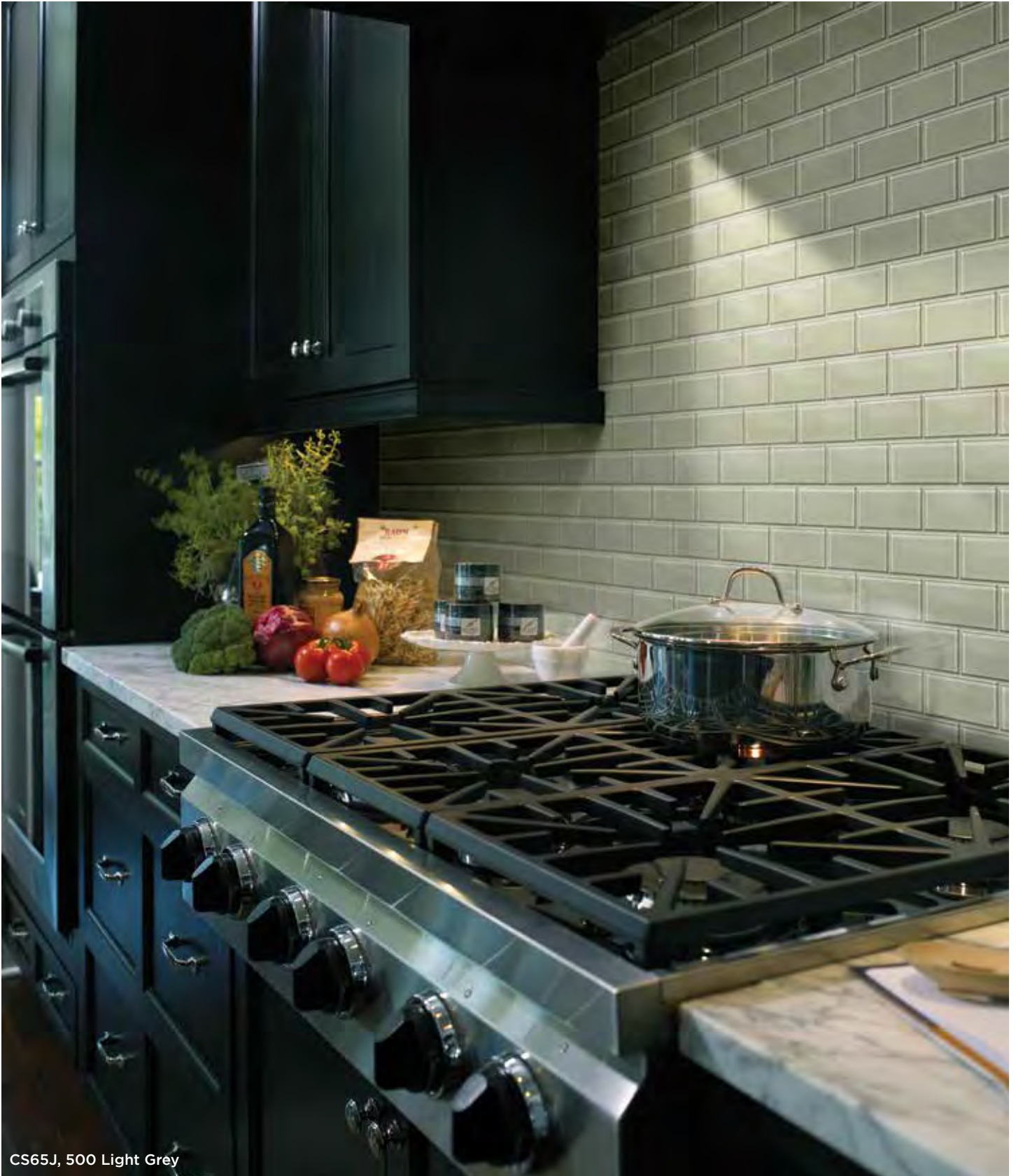
CS65J, 500 Light Grey