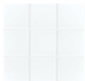
111 Super White