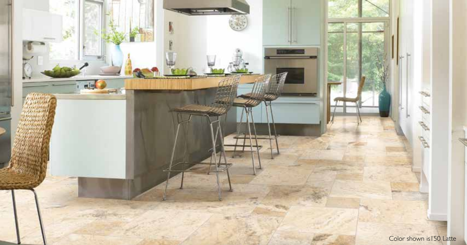
Color shown is 150 Latte