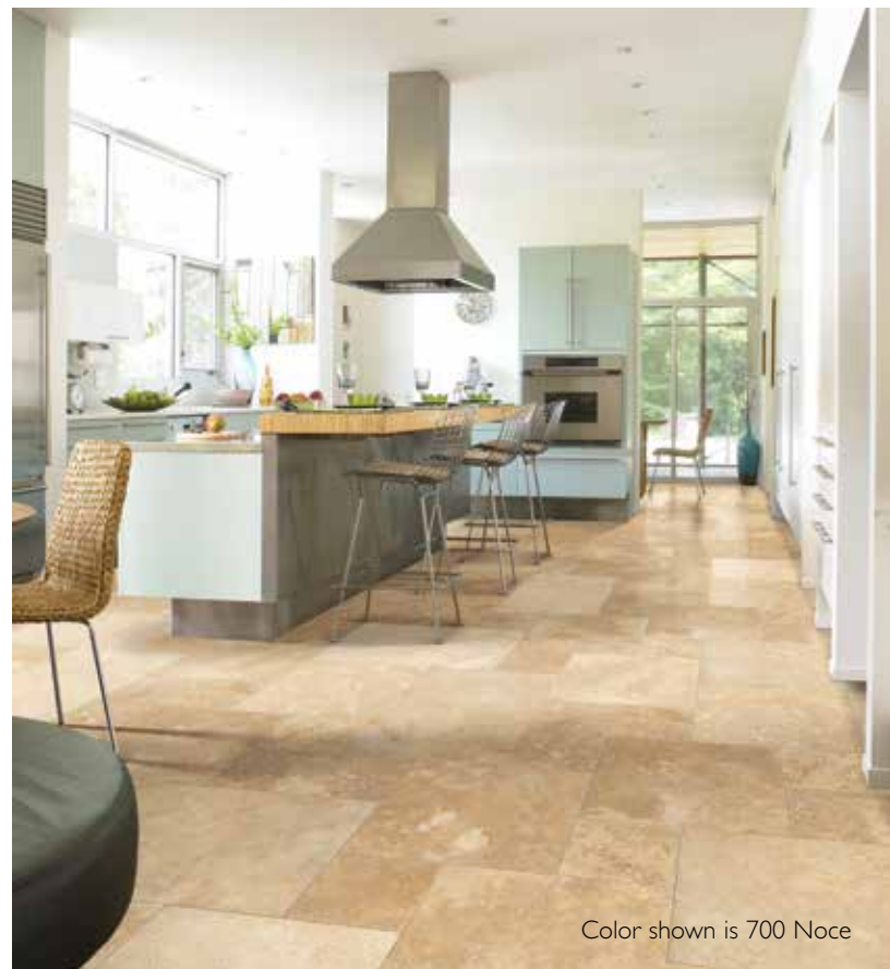
Color shown is 700 Noce