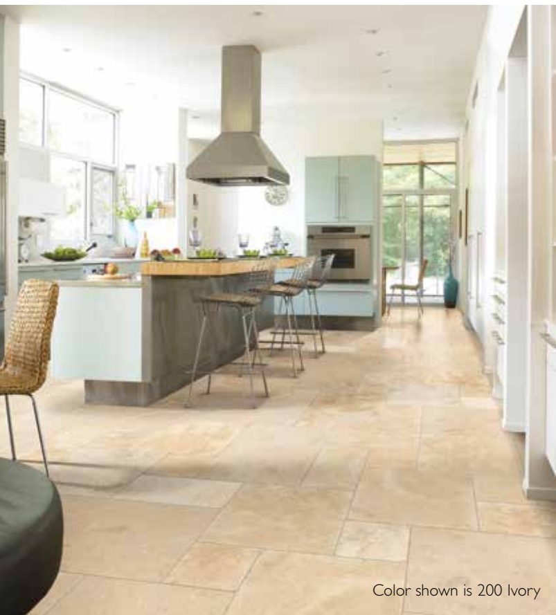
Color shown is 200 Ivory