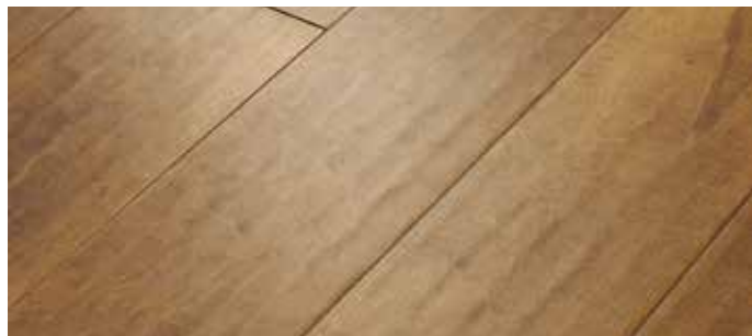
286 Sand Point