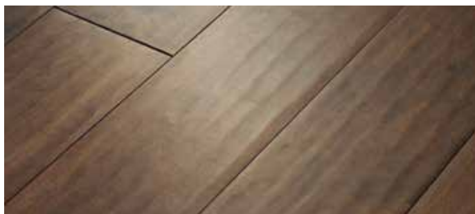
424 Bar Harbor Brown