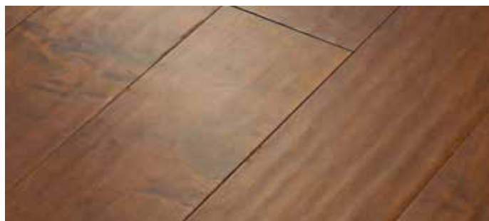
635 Granite Shores