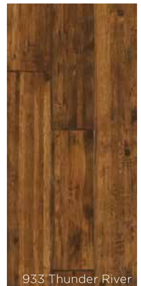
933 Thunder River