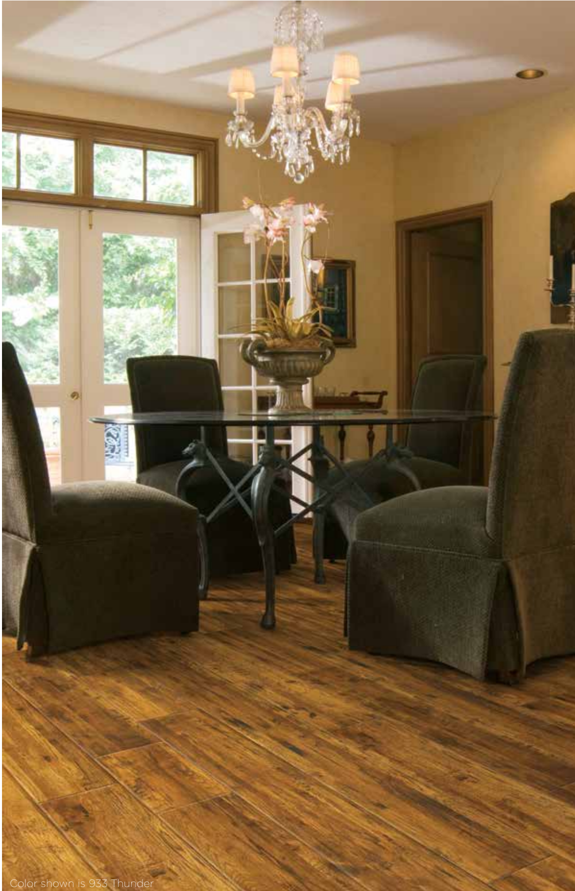
Color shown is 933 Thunder