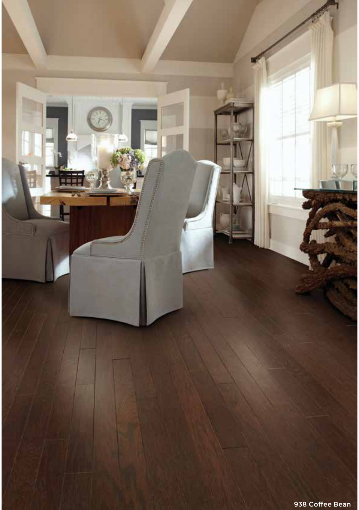
938 Coffee Bean