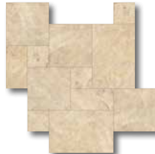
110 Sunlit Sand