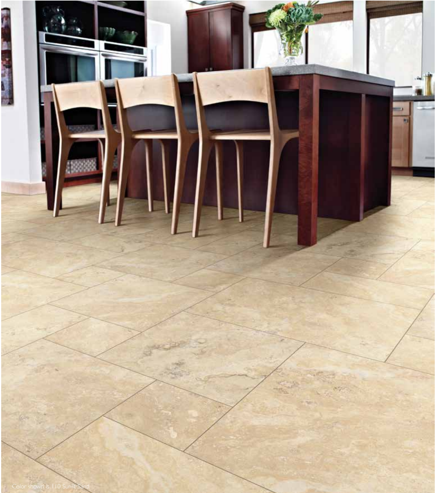
Color shown is 110 Sunlit Sand