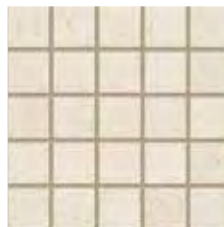
150 Bianco —creamy, grayed white with gray and cinnamon fil