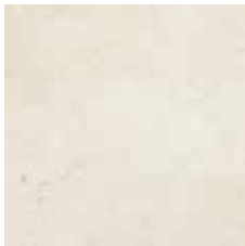
150 Bianco —creamy, grayed white with gray and cinnamon fil