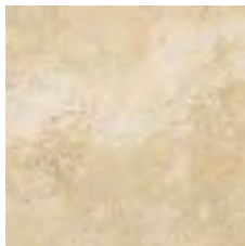
220 Noce —shades of taupe with fill in tones of brown and chocolate