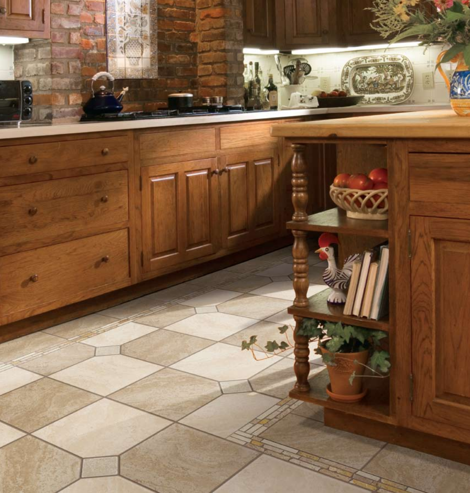
Color shown on floor is 100 Chiaro and 700 Brown with border